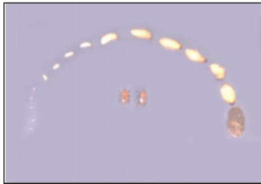
Figure (1) RPW, Life Cycle

Firstly, the weevil infests the tree and entering inside it, then the female weevil lays its egg inside the trunk of the tree, the egg hatches and the larva (about 5 inches) starts feeding on the soft fibers and it still entering and eating deep into the tissues of the tree until the trunk of the tree became empty. The total life cycle gets completed in 4 months, then the effect of the infestation will appeared outside the tree such as [the tunnels on the tree trunk, oozing of thick brown liquid, remains of weevils around the tree, breaking of the trunk or the topping ] and all this leads to the death of the tree [5].