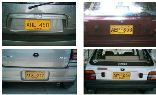
Figure 3(a) Images taken using camera

Result of the created ANPR framework is shown in this section. For this research infrared camera is used with MATLAB on computer. Pictures of cars having distinctive lighting, shades are taken (fig 3[a]) and supplied to PC. Then pictures of number plates of cars are taken having 800 x 600 resolution as shown in (fig3 [b]). The number plate is extracted from vehicle with help of yellow/white pursuit calculation (fig3 [b]). The remaining processes are focused on extracted vehicle License plate as displayed in (fig3 [c]). After extraction License plate is worked upon in parallel. Multi-fold parallel organization is demonstrated with this. Then individual characters are worked upon by taking help of Segment division’s strategies on the vehicle number plate (fig3 [d]). Results of division are demonstrated below. Finally, all alphanumeric characters are identified (fig3 2[e]).