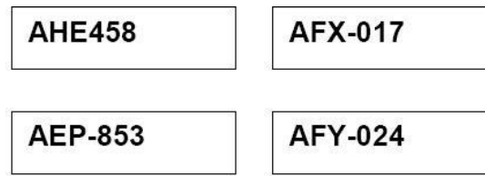
Figure 3(e) character recognition using OCR