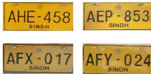
Figure 3(b) Vehicle number plate extraction