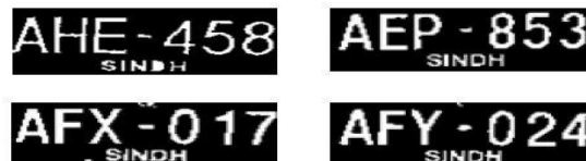
Figure 3(c) Inverted binary image