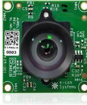
Figure 1: Monochrome camera

The primary process is image segmentation in image processing which helps in analysis of the lip print image. R- CNN is a machine learning algorithm which is used to classify an image's part by part. After the classification of the lip print image and analysis of it, the next process is the extraction of lip prints. The lip prints are extracted by converting the lip images to negative. This process is done by the software where the commands are given, and the image of the lip has been converted to negative from black and white.