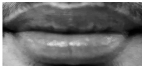
Figure 3: Not a clear lip picture of person1