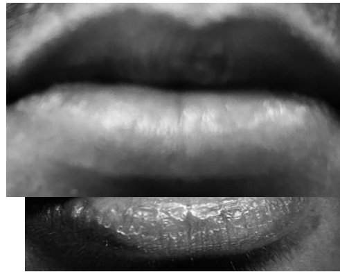
Figure 4: Not a clear lip picture of person2

This process of matching the lip prints is being conducted by supervised learning with random forest classification in machine learning is used to compare the lip prints and find a perfect match if the lip print patched with database. The database can store up to 10 lip prints. If the scanned lip print matches with the database, then the safe will be unlocked. If not, then it asks the user to retry the scanning process. The random forest algorithm helps in dataset classification and matching the lip print which matches with it. The random forest algorithm forms a decision tree to find a perfect lip print matches. It might fail when the print is not properly recorded or not present in the database. This is to improve the biometrics safety system and to create a perfect working lip print scanner to help people with biometric safety.