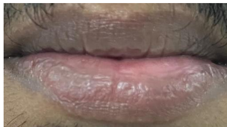
Figure 5: normal picture of a person lip

This process of matching the lip prints is being conducted by supervised learning with random forest classification in machine learning is used to compare the lip prints and find a perfect match if the lip print patched with database. The database can store up to 10 lip prints. If the scanned lip print matches with the database, then the safe will be unlocked. If not, then it asks the user to retry the scanning process. The random forest algorithm helps in dataset classification and matching the lip print which matches with it. The random forest algorithm forms a decision tree to find a perfect lip print matches. It might fail when the print is not properly recorded or not present in the database. This is to improve the biometrics safety system and to create a perfect working lip print scanner to help people with biometric safety.