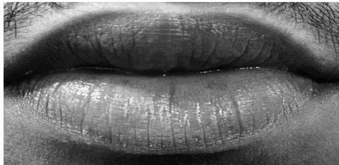
Figure 2: perfectly scanned image of person 1

The black and white image is a default image which is taken by monochrome camera and the picture shows perfect details about the lip and when the picture which is been converted to negative image it shows perfect details of the lip prints all this process has been carried out by R-CNN algorithm this take cares about the picture quality and details. As the monochrome camera only comes up with black and white images the computer then covert the image to negative images to extract the lip prints. After extracting the lip prints the computer compares the lip print which is present in the database and lip print which is been extracted.