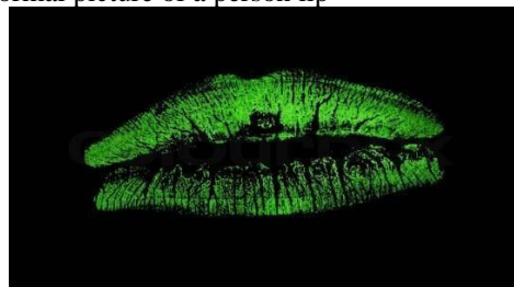
Figure 6: Extracted image of lip print