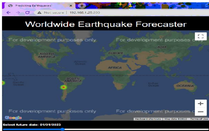
Figure 3: Output Screen shot